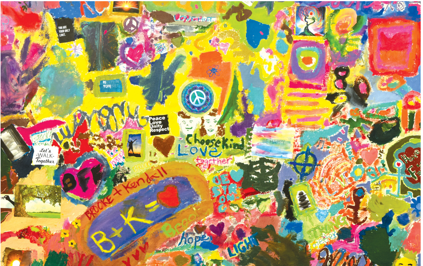
Camp Good Grief Reunion community art project